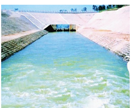
The Chennai Canal before (below) and after (above)